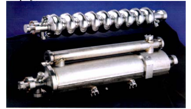
Fig. 3 9-cell cavity of TESLA

The main superconducting accelerator is one of the critical equipments in PKU-SCAF. The main accelerator module includes two 9-cell TESLA type 1.3 GHz superconducting cavities. Since TESLA represents the one of the most advanced superconducting technology in the world, we choose the 9-cell cavities<sup>[6]</sup> of TESLA as our main accelerator. It is shown in Fig. 3. Each of cavities are excited by its own coaxial power coupler. The two cavities are in one cryomodule, which is similar to that of the superconducting linear accelerator of ELBE-project at Rossendorf<sup>[9]</sup>.