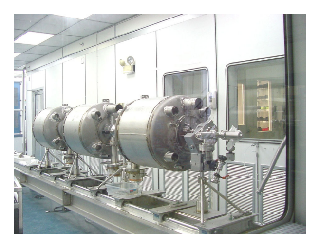
Figure 1: Medium Beta Cavity String in clean room.

The Spallation Neutron Source (SNS) [1] cryomodules were designed [2] with the intent to carry out a multiple unit production run. Assembly considerations were discussed and evaluated with respect to each component, from the cavity helium vessel to the spaceframe and vacuum vessel subassemblies. Production supporting entities such as tooling and travelers were developed in parallel with the cryomodule in order to facilitate production. All of these efforts formed together with the fabrication of the .61 medium beta prototype cryomodule. As with all prototypes, many lessons were learned from this activity about assembly sequencing, component interface and tooling interactions. These lessons will be discussed in more detail along with their feedback into the production run. Additionally, lessons learned during the beginning of the production run will also be presented.