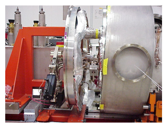
Figure 4: Enc Can Connection to the Cryomodule.

and warm beampipe assemblies. Orientation must be maintained while meeting the dimensional criteria. This requirement and assembly process underscores the importance of the component inspections (receiving inspections) performed upon arrival at JLab. This will be discussed further in the following section.