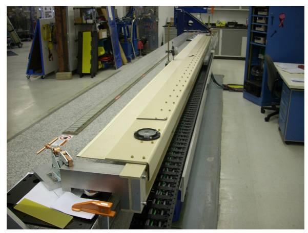
Figure 4: Moving Coil Board under construction.

The 38 AWG wires are very delicate and must be assembled carefully. They are first laid into the slot in the front of the board but return through an aluminum channel. The aluminum channel is supported by the pedestals. The board must be removed for shimming. Provisions are made to clip the return channel to the board for local transport. Bull's-eye levels are mounted to each end of the board. The photo below in Figure 4, shows the board in the process of being flattened prior to coil winding.