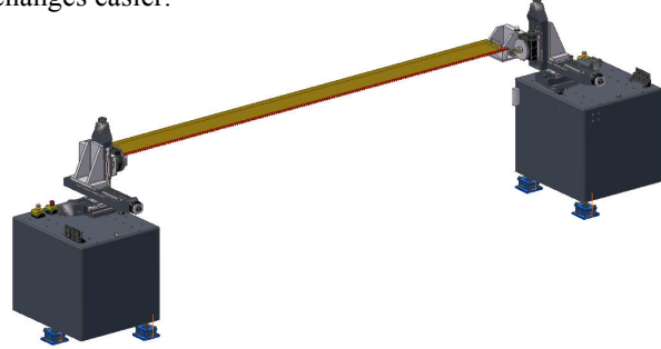
Figure 2: IFMS with the 4-m moving coil G10 board.

with extremely flat tolerance on the top surface. Each pedestal has 3 leveling feet that also provide 10 mm adjustment in the X and Y directions and 50 mm in the vertical direction. Aluminum plates have been added to the top and 2 sides of the granite to make EMO switch and cable bracket mounting as well as future mounting changes easier.