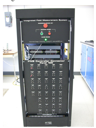
Figure 6: Standard 19 inch rack cabinet.

The control system provides 8 axis of servo control and has a position synchronized triggering on 3 axes, X, Y and rotary. The motion control system is based on a Delta-Tau Geobrick controller. Four axes (X,Y,Z, Theta) are master and four are slaves so each direction consists of a master and a slave. The flip coil can be tensioned by the Z master slave combination. The Electronics are housed in a standard 19 inch rack cabinet 42 inches high. See Figure 6 below. A Dell precision T3500 PC forms the central control point and operator interface. The PC runs Wavemetrics IGOR 6.0 which is a graphical analysis software package. ESRF's B2E was also included. The IGOR XOP (external operations) Toolkit 6.0 is provided. This is used in conjunction with NI-VISA commands provided by Metrolab and MicroSoft's VC10 C++ compiler to produce a seamless interface between IGOR and the Metrolab integrator.