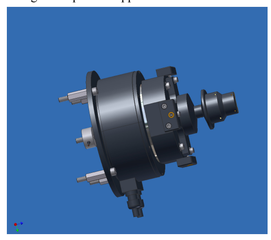
Figure 3: Rotary servo with tension sensor.

The flip coil mounts to a special spool on the rotary axis located on each pedestal. 25 turns of 38 AWG beryllium copper wire, is strung between these spools to form one continuous loop. An ADC custom circuit card will amplify and drive the long line signal back to the Metrolab Integrator card. The coil spacing is set by a replaceable grooved plastic part. Wires are soldered to gold pins mounted in the spool. The connecting cable is light AWG twisted pair shielded. The cable is tensioned with a lanyard to prevent tangling as the spool revolves. The flip coil has a tension sensor located in the bobbin as shown in Figure 3. Mounting the tension sensor in the bobbin removes the need to use a free slide under the stages thus improving the stability of the XYZ stack. The flip coils can measure first and second integrals. The first integral is measured inside the area of the coil, the second integral is measured by twisting one end by 180 degrees essentially reducing this area to zero by forming two equal but opposite areas.