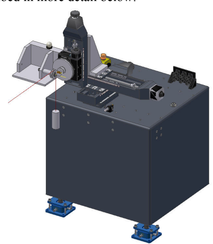
Figure 1: Integrated Field Measurement System (IFMS).

The design is a set of long coils supported by two sets of 3-axis X-Y-Z precision linear and two precision rotary positioning stages as shown in Figure 1. The PC is the primary control unit executing Wavemetrics IGOR 6.0. The motion control is based on a Delta-Tau GeoBrick with 8 axes of servo control and general IO. The integration is based on a MetroLab FDI 2056 which interfaces with one of 4 field measurement coils. These measurement coils consist of a flip coil, vertical and horizontal moving coils and a stretched wire. These are described in more detail below.