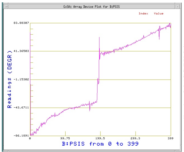
Fig. 1: Plot of beam synchronous phase though the Booster acceleration cycle. Jump in phase is due to transition crossing.

This calculation is repeated for the RF sum and beam current signals. This gives us the RF amplitude seen by the beam and a phase difference between the beam and RF. Compensating for the electrical delay between the beam and RF signals gives the beam synchronous phase shown in Figure 1.