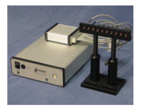
Figure 3: Example of a 10 channel joulemeter fabricated by Spectrum Detectors including DAQ and controller. The segmented detector for the real-time terahertz interferometer requires significant enhancements in size and sensitivity.

feedback resistor, the amplifiers input noise current, and the amplifier input noise voltage, which unlike the other sources has a frequency response. The accurate accounting of this noise involves the rms sum of the noise response in each frequency region. The theoretical resulting noise equivalent energy for the designed circuit is 140 pJ.