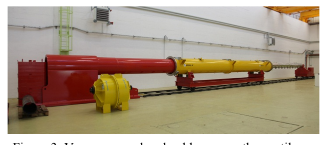
Figure 3: Vacuum vessel and cold mass on the cantilever