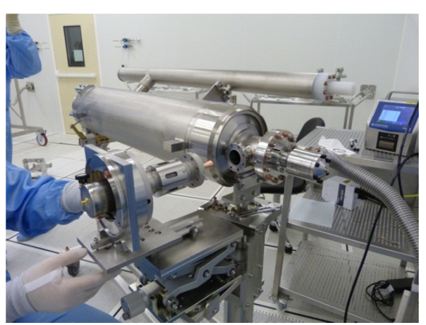
Figure 6: coupler to cavity assembly in the clean room with tools (elevator table and coupler holding) and particle counter

Small tools, especially those dedicated to clean room assembly (cf Fig. 6), were manufactured and commissioned during the prototype phase. Ionized gun and particle counters for clean room assembly were ordered and used to insure the required low level of particles on the part to be assembled (less than 10 particles over 1 minutes of 0.3 mm on the part to be assembled).