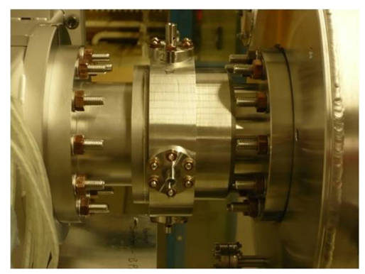
Figure 8 : BPM installed on PXFEL3_1

at CEA [3], and tested on FLASH. The integration with the cold quadrupole is done at DESY. The electronics developed by CEA in collaboration with PSI will be implemented in the modular BPM unit [4].