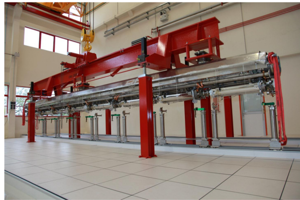
Figure 5: PXFEL2_2 cold mass and string hooked to the girder in the Roll-Out area

The infrastructure was equipped with the services and fluids for the CM assembly. Big tools such as girders and pillars (cf Fig 5) have been manufactured ahead of time and commissioned along the prototyping phase.