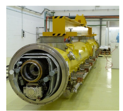
Figure 7: CM after warm coupler assembly

The tests and controls have been detailed (RF, mechanical, vacuum, electrical), implemented and validated. The automated RF and tuner test bench have been developed for systematic measurements and recordings as well as the alignment and particle counter software. They have been tested on the prototypes.