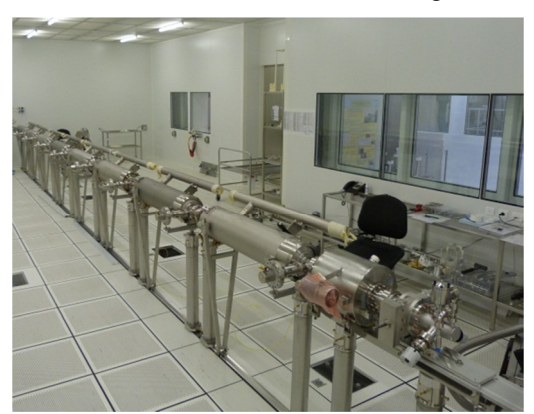
Figure 4: PXFEL2_2 in the ISO4 clean room facility

Meanwhile, CEA has conducted industrialisation studies aiming at defining industrial equipment and methods for the cryomodule assembly. The first study has determined the workflow from the storage to the shipment, with cavity reception, clean room assembly, roll-out, alignment, vessel roll-over and coupler assembly (see Figs.2-7). The areas have been dimensioned accordingly and matched to the infrastructure which was renovated from the previous Saturne Synchrotron Laboratory facility: the 200m2 clean room complex with 112 m2 under ISO4 allows us to assemble the couplers to the cavity and two cavity strings in parallel; the cryostating will be held on the 1325 m2 of assembly platforms and 400 m2 are dedicated to storage.