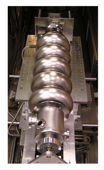
Figure 4: The first niobium BNL3 cavity (courtesy of AES).

Fabrication of the first niobium cavity, BNL3-1, was completed recently at AES (Figure 4). It was made using 3-mm thick high-RRR material. All flanges are Conflat. RF measurements showed field flatness of \pm 3\% and the resonant frequency within the specification so no cavity tuning was necessary after fabrication. The cavity is now being prepared for BCP, 600°C vacuum bake and HPR. It will be tested at the BNL's vertical test facility in late 2012/early 2013.