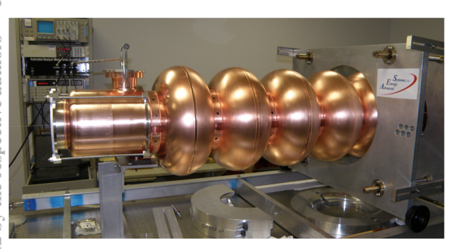
Figure 3: BNL3 cavity copper model undergoing frequency tuning at AES.

Structural and thermal analysis, the cavity mechanical design, fabrication of a copper model and the first niobium cavity were done by AES, Inc. as part of collaboration with Stony Brook University and BNL. The full-scale copper model was designed and built with detachable end groups to provide more flexibility in studies of its HOM properties [6]. Because of a large cell-to-cell coupling, the initial field flatness was already very good at 90% right after manufacturing. It was improved to \pm 1.2\% after tuning. The copper cavity is shown in Figure 3. A copper prototype of the HOM coupler is fabricated, and the HOM studies on this cavity are in progress [6].