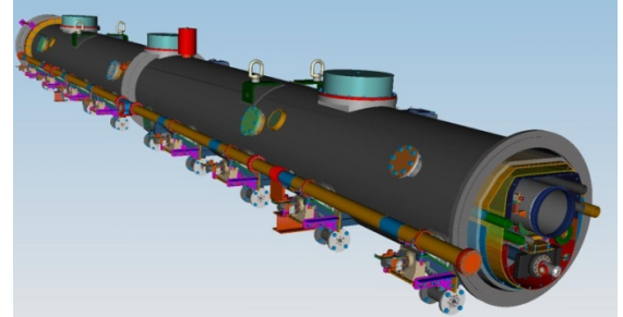
Figure 4: Type 4 Cryomodule.

Fermilab plans to produce four more cryomodules after CM2. The design of these four modules will be Type 4. Several design optimizations were done from Type 3+ to Type 4. The magnet will be located in the middle of the module for CM3. Also to support the R&D for Project X at Fermilab, Type 4 design gas return helium pipe structure has the capability to support magnet/s at position 2, 5 and 7 as needed. The cavity and the magnet support schemes are the same in the Type 4 design; therefore this allows us to either install a cavity or magnet at the above specified locations. A CAD model of Type 4 design 1.3GHz module can be seen in Fig. 4.