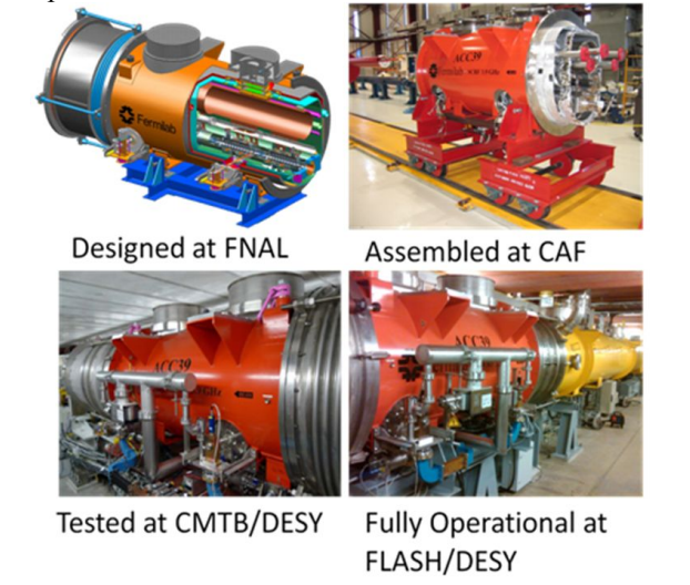
Figure 2: 3.9GHz cryomodule from design to successful operation at FLASH.

This effort has proven to be far more than merely a scaled version of a 1.3GHz TESLA module. With this work successfully complete, Fermilab has gained valuable experience in designing, fabricating and assembling SRF devices as well as building up the necessary expertise and infrastructure. From the assembly stand point of view, the successful assembly and operation of this module proved that CAF infrastructure and CAF group technical competence is up to the par to conduct R&D on SRF components.