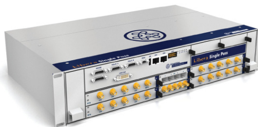
Figure 2: Libera Single Pass H.

Libera Single Pass H is a new generation of single pass monitor that is designed for proton or heavy ion LINACs. Beside the position of the beam it also measures the phase of the particles.