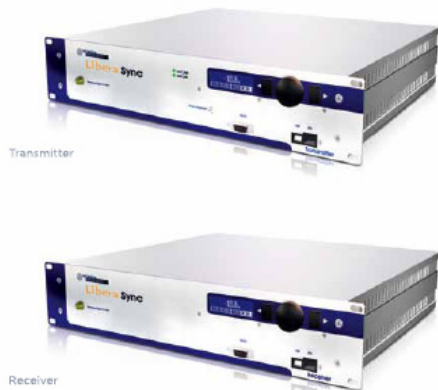
Figure 4: Libera SYNC.

With this goal in mind the Libera SYNC system was developed.