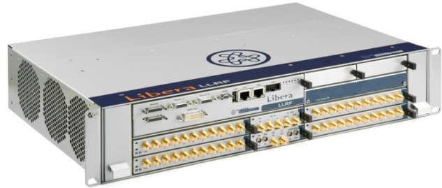
Figure 1: front and side view of Libera LLRF.

The Libera LLRF system was designed and developed to be modular and configurable, with the aim to fulfil various requirements from different accelerators. Fourth generation light sources have especially stringent requirements in terms of stability. A challenge of such systems can arise from the need to stabilise RF pulses of short duration.