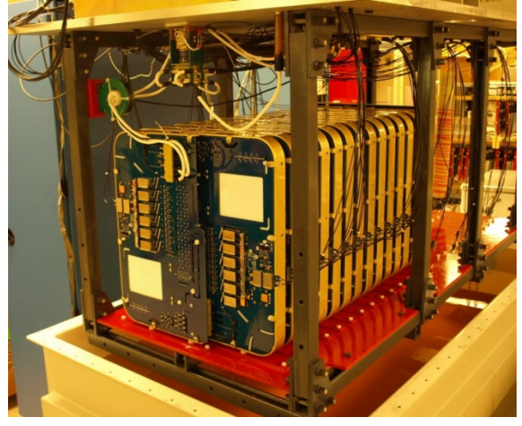
Figure 1: The Yale Marx 500 kV modulator charges many stages in parallel at low voltage, then discharges in series at high voltage. Each 12.5 kV, 250 A "flat pack" module is identical, providing for low fabrication and assembly cost.

*Work supported by U.S. Department of Energy SBIR Award DESC0004251