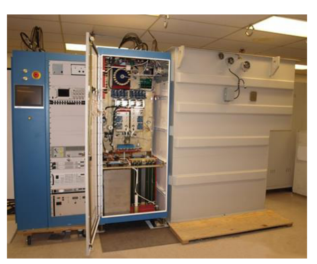
Figure 1: System designed for Oak Ridge National Laboratory Spallation Neutron Source. Design is optimized for long pulse operation with highest possible reliability and availabilityrequired for particle accelerator user facilities and test stands. High voltage cables connect to dummy load or klystrons not shown in figure.