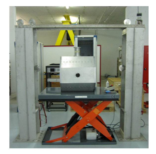
Figure 1: Bead pull system and cold model of RFQ in aluminium.

The lab is also equipped with a remotely operated beam pull system for field measurements (Fig. 1). The clean room is close to the test cryostat where superconducting cavities can be tested at T=4.5^{\circ} K. The space dedicated to the clean room has been prepared for assembly and testing of both particle detector systems and RF cavity systems. Total surface is of 50 m^2 , divided in three main areas (Fig. 2):