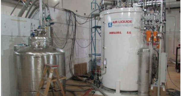
Figure 3: Helium cryoplant during commissioning phase.

The standard 4 K helium liquefier-refrigerator is chosen both for budgetary and technical reasons. 4 K-2 K transition required for operation of e-linac cryomodules is achieved on-board of each cryomodule. The cryoplant was specified with 30% capacity contingency with respect to the e-linac cryogenic loads. During the acceptance tests the performance of the cryoplant in main regimes was confirmed (Table 1).