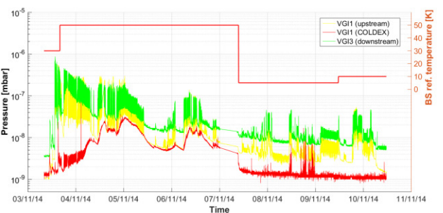
Figure 1: Pressure evolution during SPS Scrubbing Run 1.

During the BS cool-down from 50 K to 5 K, a net pressure decrease was observed in the BS (~4·10<sup>-9</sup> mbar) and partially at the extremities ( \sim 2.10^{-9} mbar). At 5-10 K. the BS was capable of physisorbing the residual H<sub>2</sub> and cryocondensing N2 and CO. Throughout the run, during beam circulation, no pressure rise was observed at 5-10 K in the COLDEX BS, nor vacuum degradation imputable to electron stimulated desorption. Pressure rises up to \sim 2.10^{-8} mbar were instead measured at the extremities. In this period, extensive use of doublet 5+20 ns beams was deployed in the machine for further scrubbing. With respect to comparable 25 ns bunch and circulating beam intensities, no increase in the electron stimulated desorption rate was observable in the RT COLDEX sections. This behaviour is consistent with what was observed in the other SPS field-free regions.