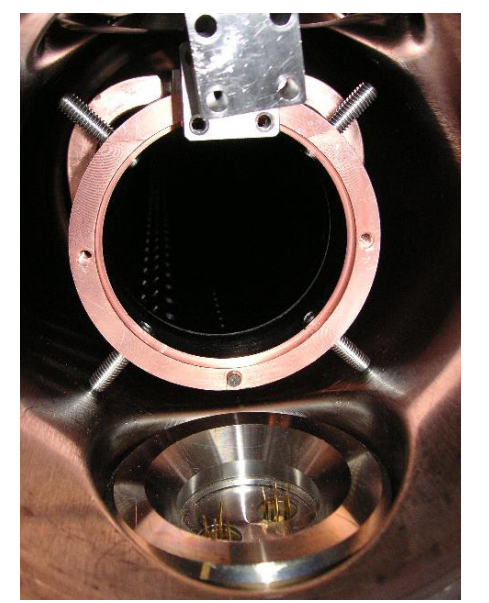
Figure 1: Picture of the a-C coated beam screen during reinstallation on February 2014.

intercept straight electron paths to the CB. The BS is equipped with two 0.1 mm thin copper coated cold-towarm transitions (CWTs) at its extremities. RF continuity is assured with RF fingers. The final adaptations to the upstream and downstream ID 100 mm chambers are tapered with conical apertures of 45°. Total pressure is measured at these two warm locations, i.e. upstream and downstream the BS, via calibrated Bayard-Alpert (VGI) hot cathode and Penning (VGHB) cold cathode ionization gauges.