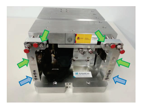
Figure 2: Transportation blocking screws (Green). Once installed they can be placed in holes marked by blue arrows.

Reception tests have been carried out by CIEMAT personnel in XFEL. Then, results from validation report and integrity are checked again in final destination after delivery.