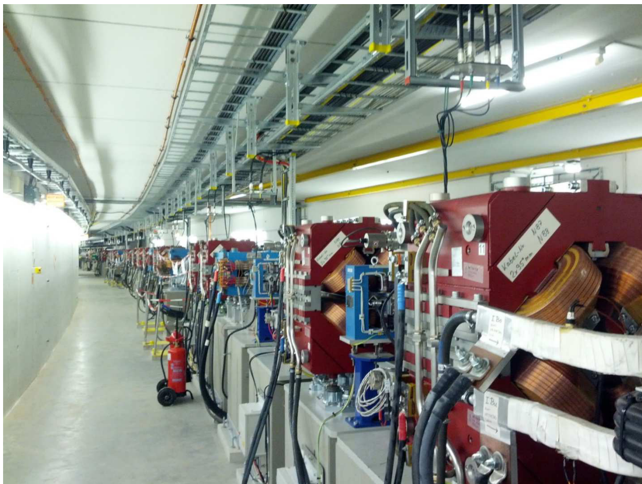
Figure 4: PETRA III extension North. The new DBA like lattice of the extension section North is shown in the photo from April 2015.

The beam quality in the 960 bunch mode has not yet achieved the design values due to ion effects which are degrading the vertical emittance.