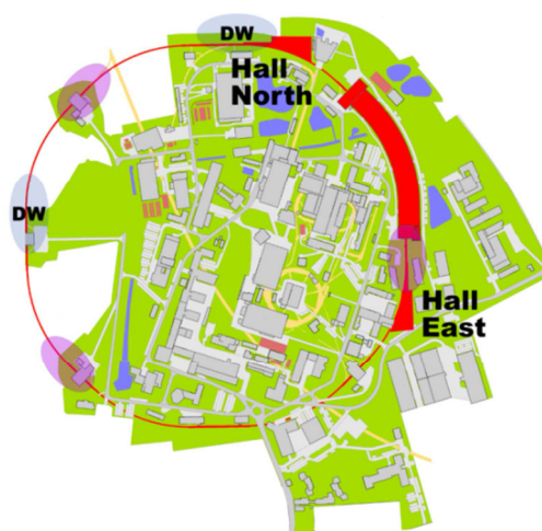
Figure 1: Layout of PETRA III. Two new halls in the North and East have been added.

lines in the Max von Laue experimental hall. The location of the new halls is shown in Fig.1. A detailed layout of the hall North of the PETRA extension is shown in Fig.2. The original plan to reuse the existing accelerator tunnel [3, 4] was not implemented since a new tunnel section is advantageous for the installation of the front end components of the beamlines. The decision to completely reconstruct the tunnel sections was one of the reasons to revise also the project schedule.