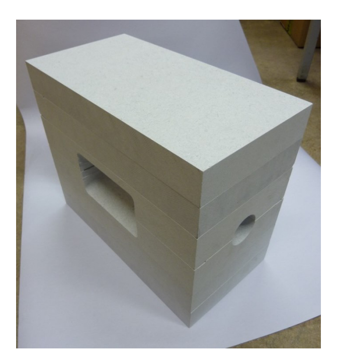
Figure 4: Heat insulation for the plasma cell.

Finally, the plasma cell is encompassed within a thermal insulation to maximize the heater function. For the PITZ experiments, heat insulation was chosen in the form of solid foam bricks. The shape of the plasma cell was formed by shaving the material, leading to an insulating cage closely enveloping the cell, as shown in Fig. 4. One opening for the beam pipe can be seen to the right, one opening for the laser port to the left.