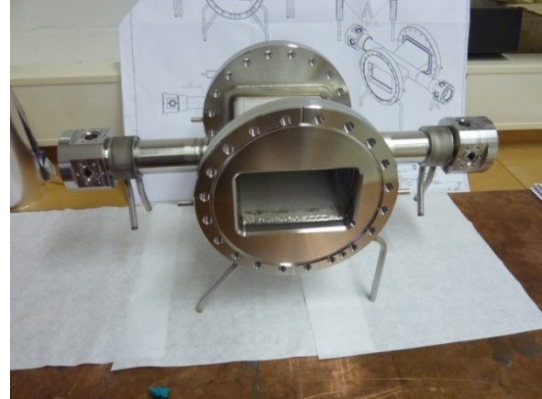
Figure 2: Fabrication of plasma cell body. a) fabricated parts. b) finished cell body, welded together.

The next parts to be fabricated were the copper heat conductors. The copper parts which are shown in Fig. 3 surround the plasma cell core and have grooves to fit heating elements. These are electrically driven, resistive heating elements. The heat will be transported via the copper elements into the plasma cell. Four heating wires (Thermocoax) will be used, two in the centre (above and below the middle plane) and two on each side around the beam pipe. This will allow for adjustment of the temperature profile by distributing heating power among the elements along the beam pipe accordingly.