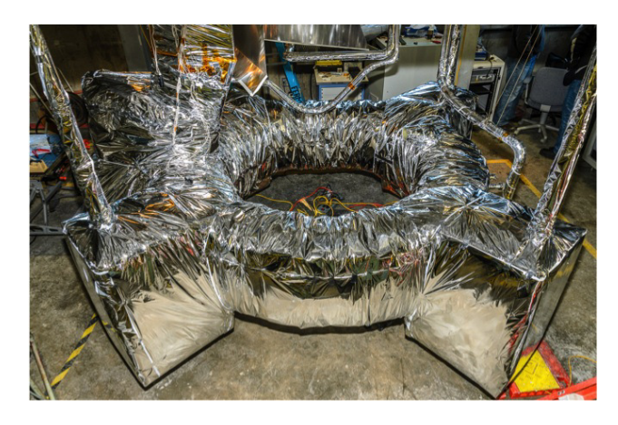
Figure 7: First CC cold mass at the Solenoid Test Facility at Fermilab after MLI rewrapping.

The 2.5 T superconducting CC magnets located around the RF cavity assemblies are the largest magnets in the MICE cooling channel and provide an additional longitudinal magnetic field to confine the beam between the absorbers. The coupling coil magnets and cryostats are designed by a collaboration between LBNL and the Harbin Institute of Technology (HIT), China. The first coil was wound at Qi-Huan Corp., China, and shipped to HIT. After preparation at LBNL it has been shipped to Fermilab where it is being tested and will be trained in the Solenoid Test Facility. Figure 7 shows the cold mass at Fermilab. During the first cold mass test