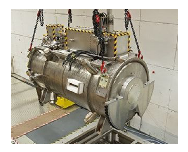
Figure 3: The first MICE spectrometer solenoid fitted with a fiber tracker is being moved to the MICE hall.