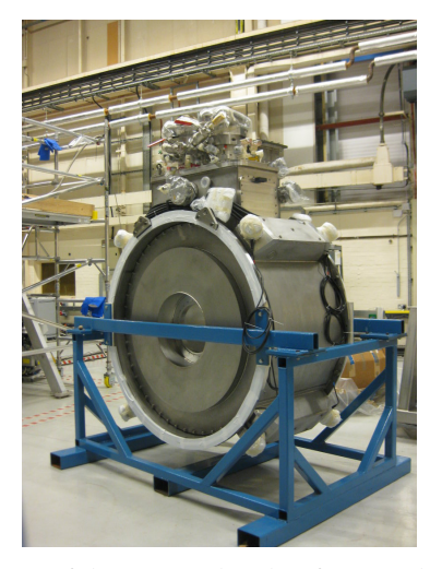
Figure 4: One of the MICE absorber focus coil modules at RAL.

The Absorber Focus Coil (AFC) module shown in Figure 4 sits between the two spectrometer solenoids and consists of two superconducting coils surrounding an absorber. The focus coils have been built by Tesla Engineering Ltd., UK. As muons pass through the absorber their momentum is reduced in all three dimensions. The focus coils provide strong focusing to confine the beam and the coils can be operated with the same ("solenoid mode", requires lower currents in the coils) or opposite ("flip mode", higher cur-