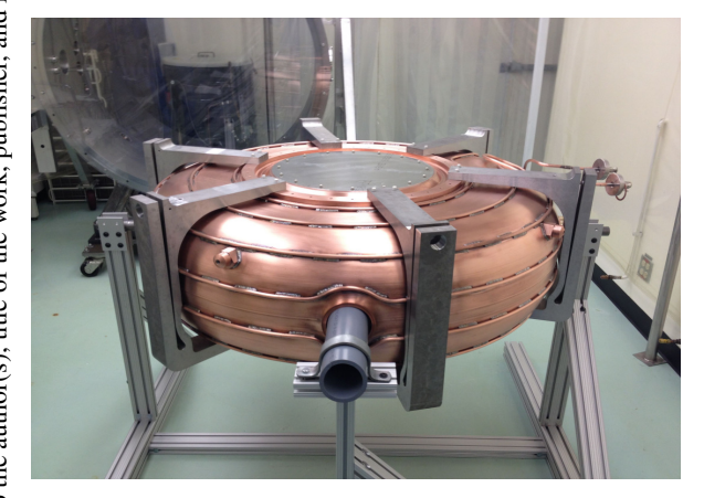
Figure 6: First MICE RF cavity being fitted with tuners at Fermilab.