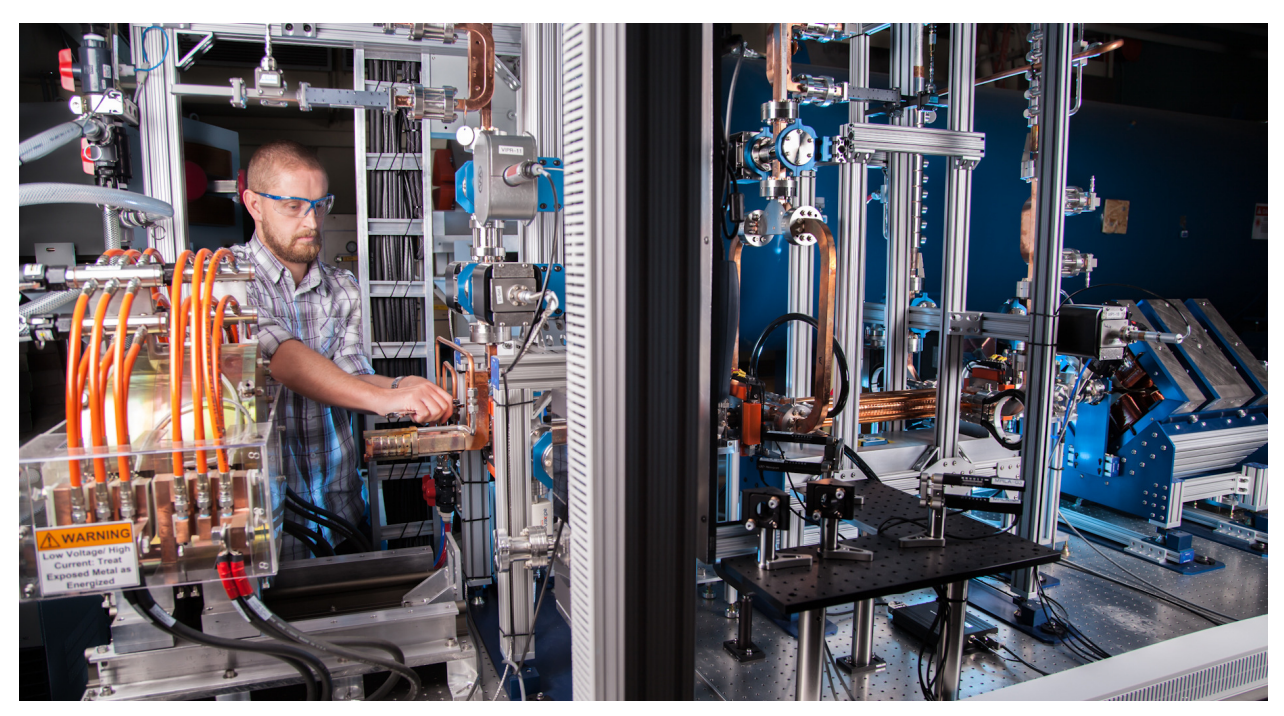
Figure 2: Photograph of the X-band test station.

mounted together in triplets, with each stand having adjustability. The steering magnets are mounted onto beamline vacuum flanges.