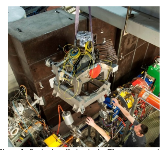
Figure 3: Cavity installation in the Elettra storage ring.

In 2003, 2009 and 2013 respectively, three among four cavities have been replaced having an improved copper losses capability of 60 kW as shown in Fig. 3.