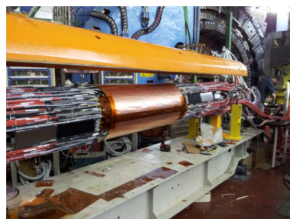
Figure 2: The DA \Phi NE IR with the new detector layers ready to be inserted in KLOE-2.

The IP chamber and the low- \beta defocusing quadrupoles are suspended at the two sides of the detector. The whole support structure is critical for the stability of the assembly.