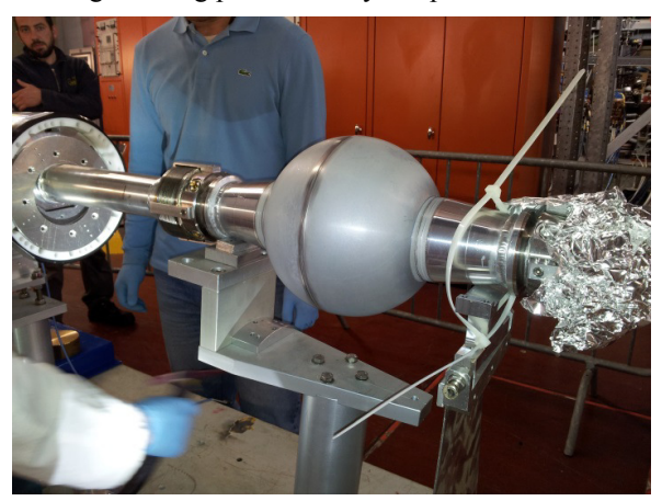
Figure 1: IP spherical vacuum chamber.

defocusing quadrupole low-β heating problems, recovering working point stability in operations.