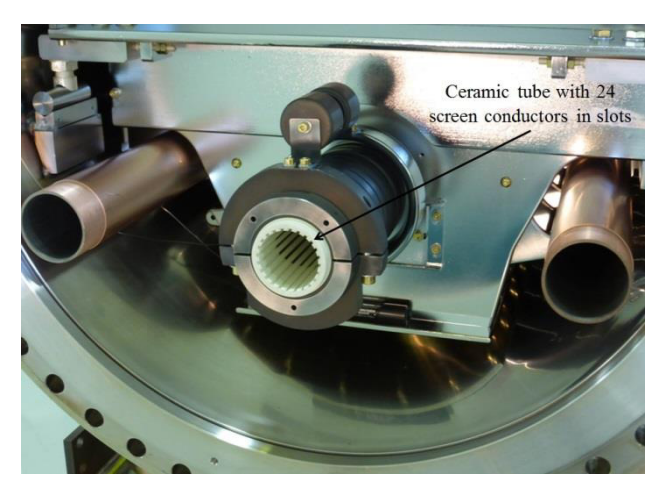
Figure 1: Upgraded MKI, in its vacuum tank.

This paper identifies the elements of the injection and beam dumping systems which require modifications in the context of the HL-LHC project. Changes to protection elements of the injection system are planned to be implemented during LS2, following the upgrades of the injector chain. Upgrades to both the injection kicker magnets and the beam dumping system will take place in LS3.