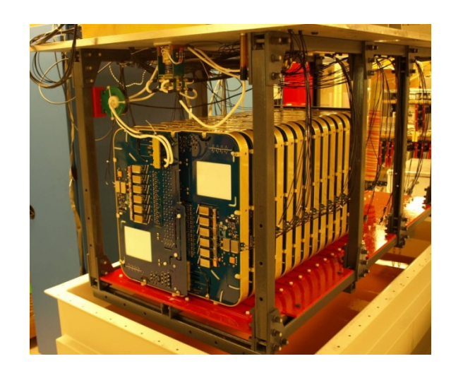
Figure 1: The Yale Marx 500 kV modulator charges many stages in parallel at low voltage, then discharges in series at high voltage. Each 12.5 kV, 250 A "flat pack" module is identical, providing for low fabrication and assembly cost.

The Marx topology allows a new degree of freedom unavailable to other architectures – DTI can intentionally underdamp the series snubbing within the pulse circuit. This cannot be done conventionally – the reactive overshoot endangers the load. In a Marx, we can compensate for the overshoot by initially firing only a subset of the switches – thus "sling-shotting" the leading