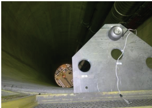
Figure 3: Adapted Taylor Hobson sphere and forced centring plate above the ECA4 shaft.

In April 2012 survey measurements established a link between reference points in the experiment hall (ECX4), at the bottom of the shaft, and the start of the CNGS beamline. Shortly afterwards three geodetic pillars close to the site were measured by GPS, and a small survey network established, and measured, to connect these pillars to points installed around the access shaft. Plumb bobs were installed on forced centring plates, Fig. 3, and the wires were observed by a total station, at two different instrument stations in the experiment hall.