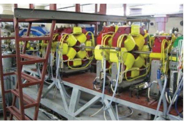
Figure 6: NESTOR interaction section.