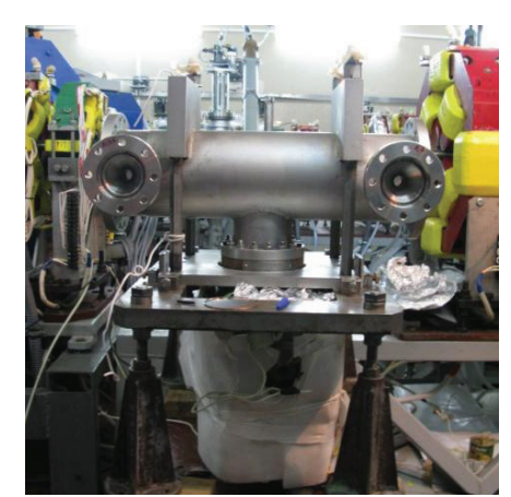
Figure 5: NESTOR inflector vacuum chamber before installation.