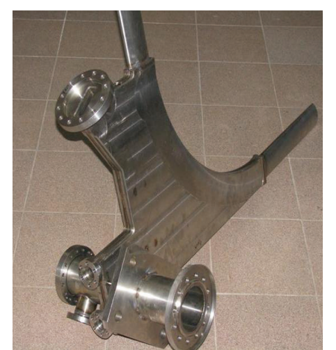
Figure 3: Dipole magnet vacuum chamber view.