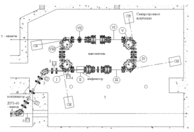
Figure 1: The lattice of X-ray generator NESTOR injection channel and storage ring with layout of vacuum system.

In Fig. 1 the NESTOR injector channel and storage ring magnetic lattice, and layout of the vacuum system with pumping units are shown.