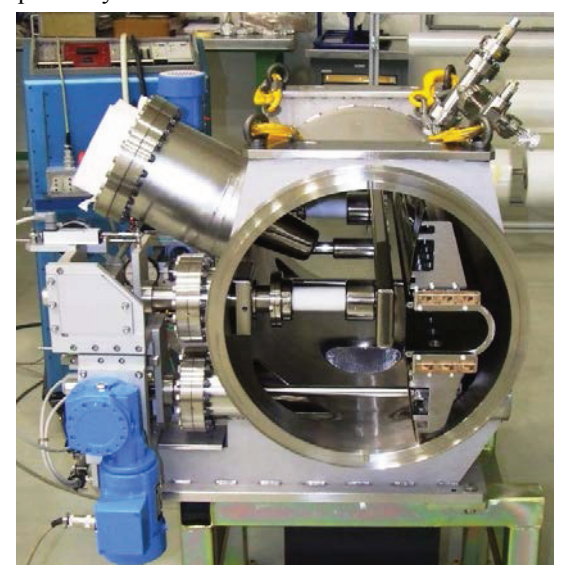
Figure 1: Electrostatic extraction septum (ESE).

longer than the ESI. Both devices use the same HV feedthrough and mechanical supports for the septum and insulating rods for the cathode. The septa are made of Molybdenum foils, which are tightened on a stainless steel support frame (in which the circulating beam passes). By tightening the foils in successive steps, allowing the foils to settle (typically 1 day pauses between steps), an overall flatness of \pm\,70\,\mu m was achieved. This means that the apparent thickness of the septum is smaller than 170 \mu m . The cathodes are made of solid Titanium to improve robustness and good vacuum compatibility.