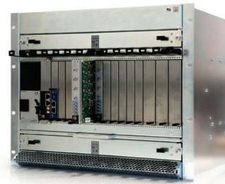
Figure 4: The MTCA.4. Crate. From left: Power supply, MCH, CPU, 2 x Libera Spectra module, space other 8 modules and/or another power supply.