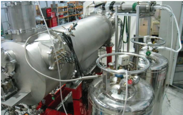
Figure 6: Cryomodule undergoing final cold testing prior to installation on ALICE.

*The value should be considered only qualitative as it is difficult to measure the heat losses with continuous two phase flow of LN 2 . Improved results will be available after the cold tests at 4K