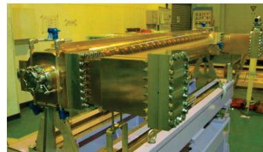
Figure 3: Prototype L-band accelerator structure for BCS.

The choice of 5/11 times S-band linac frequency offers two features, larger longitudinal acceptance and the reduction of the injection loss at the damping ring by suppressing the S-band satellite [13].