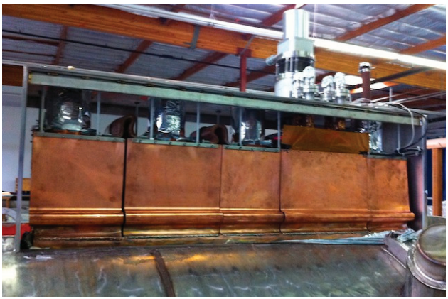
Figure 4: Improved shield connection to cryocoolers.

Another improvement to the magnet design was the enhancement of the thermal connection between the first stage of the cryocooler heads and the radiation shield. The original design used a series of aluminum straps to make the connection. The new design uses an array of flexible copper sheets to provide a larger cross sectional area and a more thermally conductive material (see Fig. 4).