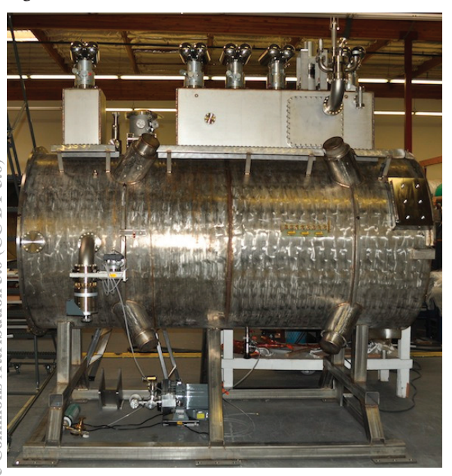
Figure 6: Completed reassembly of first magnet.

warm nitrogen purging of the cryostat to remove water vapor, and test running of the cryocoolers to verify proper operation and functionality of the temperature sensors. An overall view of the first completed magnet is provided in Fig. 6.