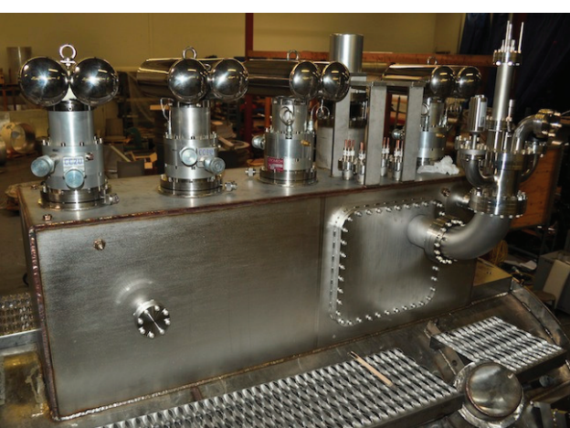
Figure 5: Completed main cryocooler tower.

In order to accommodate the addition of two cryocoolers, a new main cooler tower was fabricated, and a second tower containing one cooler was added as well. The main tower now houses four of the two-stage coolers, the single-stage cooler and all of the power feedthroughs for the coil leads. A photo of the completed main cryocooler tower is shown in Fig. 5. A new port was also added to the main tower that incorporates a series of vacuum gauges and a residual gas analyzer (RGA) head. The improved vacuum and instrumentation system will allow for better MLI performance by ensuring that a sufficient amount of moisture is removed from the system prior to cool down.