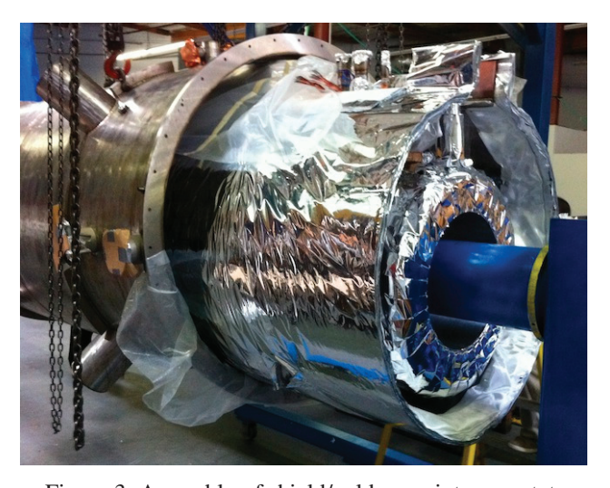
Figure 3: Assembly of shield/cold mass into cryostat.

Another improvement to the magnet design was the enhancement of the thermal connection between the first stage of the cryocooler heads and the radiation shield. The original design used a series of aluminum straps to make the connection. The new design uses an array of flexible copper sheets to provide a larger cross sectional area and a more thermally conductive material (see Fig. 4).