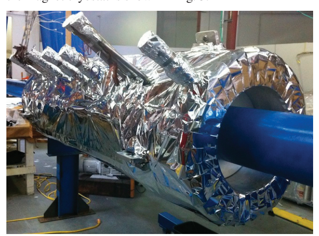
Figure 2: Cold mass after MLI wrapping.

The MLI wrap on the magnet cold mass has been improved by incorporating a seris of custom cut blankets that were derived from a 3D CAD model. A series of brackets were also added to the exterior of the cold mass to provide a uniform MLI wrap surface and to prevent compression of the MLI layers. A photo of the completed cold mass is shown in Fig. 2. A similar MLI scheme was used for the radiation shield, which was remade using series 1100 aluminum rather than the previous 6061 aluminum in order to icrease its thermal conductivity. A photo of the cold mass/shield assembly being installed in the magnet cryostat is shown in Fig. 3.