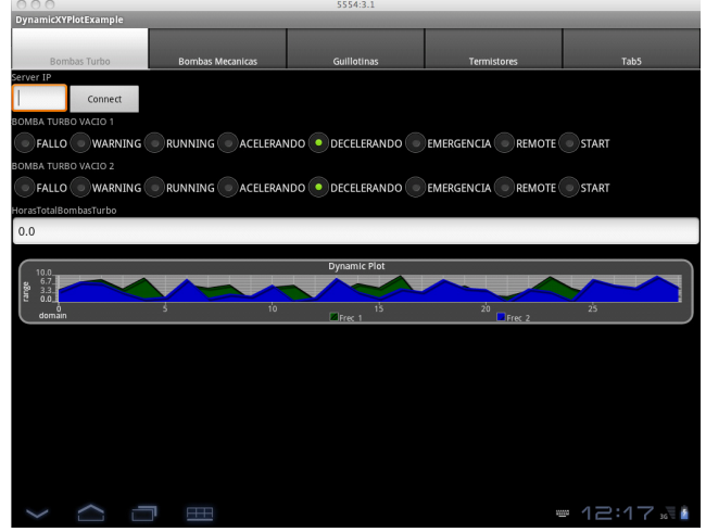
Figure 3: User interface of the Android application.

The application for Android has been developed in Eclipse using the ADT (Android Development Tools) and tested on the emulator provided on the Android SDK [1]. The program has been written for the API Level 7 (Android 2.1), compatible with all the newer version and APIs. All the libraries used in the project are provided with the ADT, except for the ICE specific ones and those used to build the XY plots. These last were imported from the "androidplot" project [2], which offers a pure Java API for creating dynamic and static charts within Android applications.