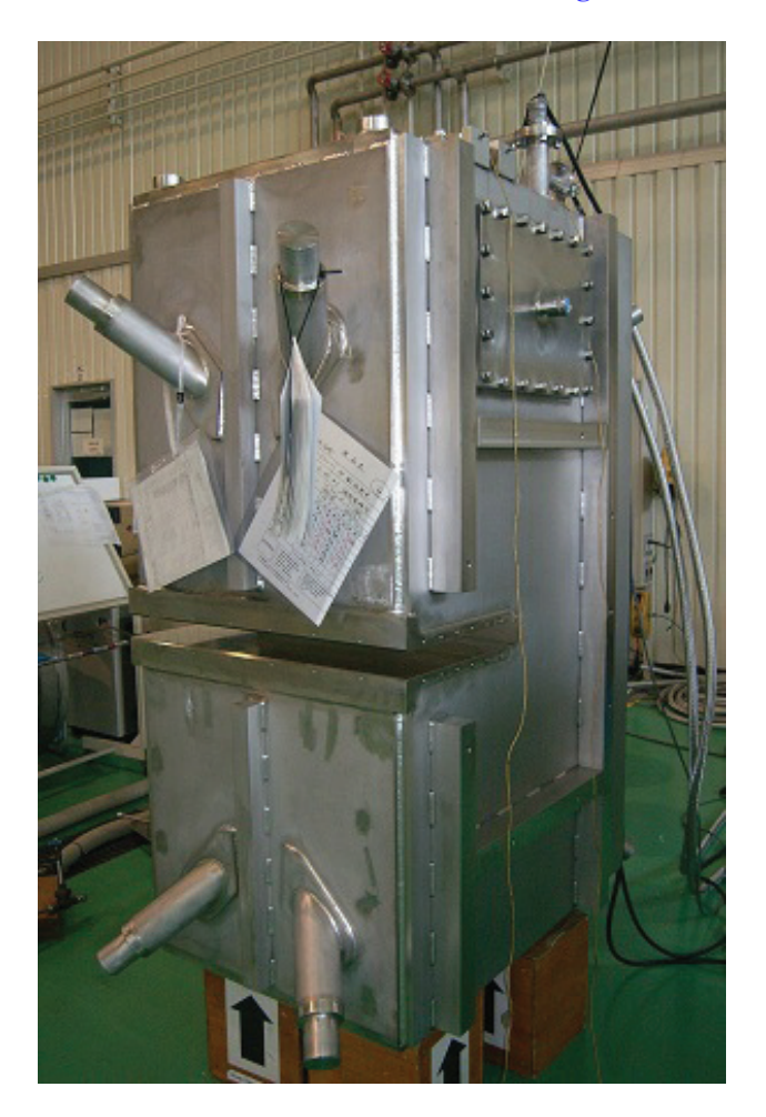
Figure 4: Photo of a superbend at manufacturing factory