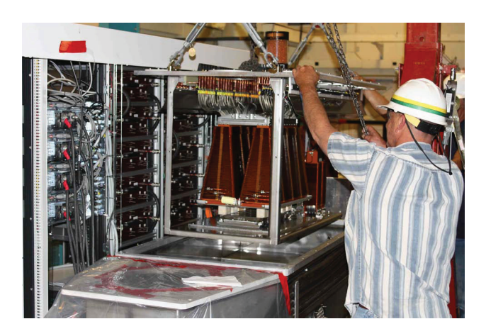
Figure 3: Final modifications to ScandiNova K2-3X high voltage modulator.

station experimental program will focus on installation and commissioning. We have completed the process of preparing the facility, e.g. bringing in additional electrical power and cooling water. The K2-3X modulator is ready and has been installed. Initial on site testing of the klystron will occur this Fall. The RF distribution system will be installed and tested in sections over the next several months as components arrive. The test station is schedule to be completed this calendar year.