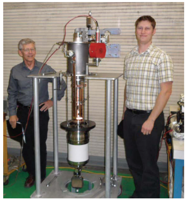
Figure 4: The LLNL XL4 klystron awaiting final testing at SLAC.

Experiments will benchmark modeling results and focus future research and development on solving the technical challenges to increasing gamma-ray flux and repetition rates. The technology developed on the test station will serve as the basis for future upgrades to LLNL's center for gamma-ray applied science to further increase the