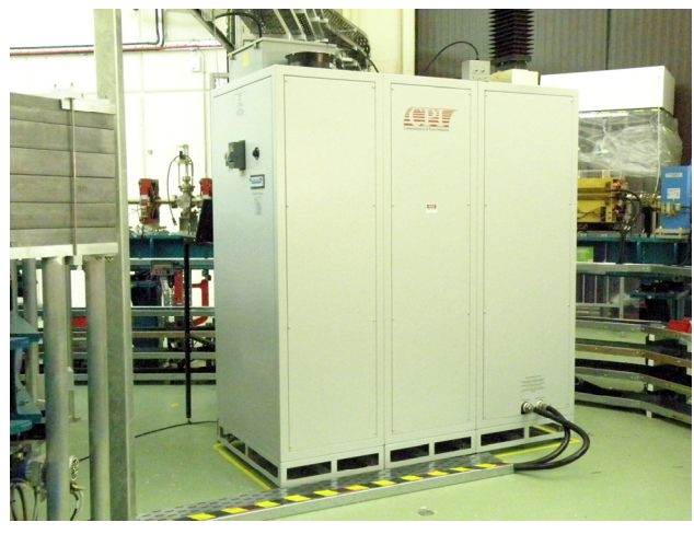
Figure 1: VIL409 high power RF amplifier installed at the Daresbury Laboratory

could be optimized for use in the EMMA accelerator. Therefore, the user has the ability to remotely set IOT Beam voltage within the range from -38 to -45 kV (with respect to Earth/ground) and the IOT grid bias voltage within the range from -85 to -130 V (with respect to the IOT's cathode potential). In addition to a straight forward DC grid bias voltage set, the user may also elect to pulse the grid.