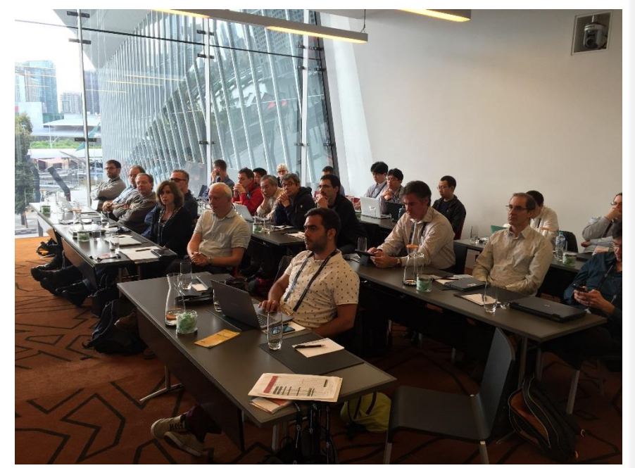
~30 participants from four continents

Six in-depth presentations & an awesomely lively discussion session