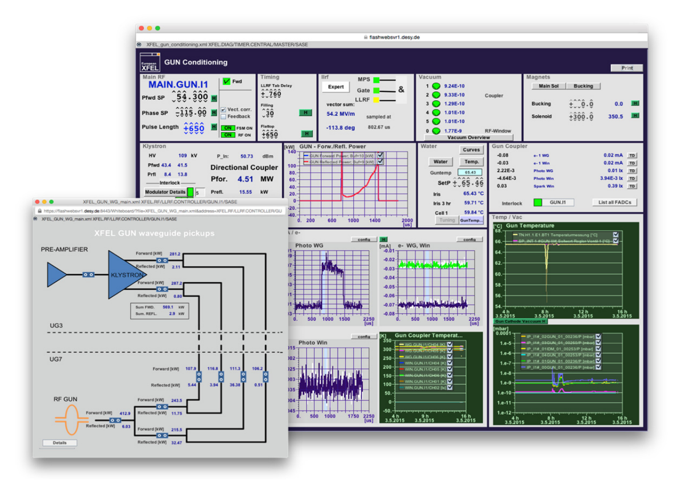
Figure 3: Screenshots of the JDDD web interface running in a Safari web browser (bigger panel) and in a Firefox (smaller panel). All useless browser toolbars are removed and each panel is opened in a separated window. Thus the look and feel and the operation of the panels is equivalent to native JDDD.