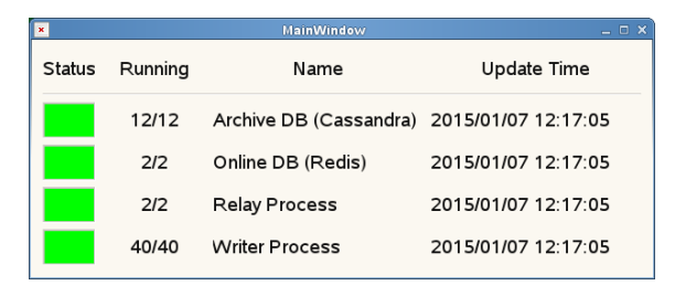
Figure 3: Screen capture of monitoring tool for operators.

We build two monitoring systems for relay and writer processes. One is a simple system shown in Fig. 3 that displays alive or dead status of processes and runs on the display wall in the main control room to display status to operators. The other is for system experts shown in Fig. 4. It displays show message per seconds, elapsed time to write into database, and other information. The application also send/receives messages to/from relay servers for the test. Both monitor applications were written in C++ with Qt4.