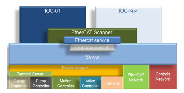
Figure 2: Logical Model.