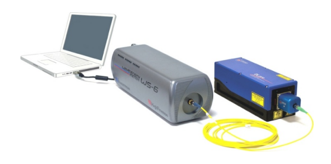
Figure 1: High Finesse Wavelength measuring device interfacing a windows computer and a light source.

For the purpose of integrating measurement results from this device into custom applications, all program values and settings are accessible for user via calls to a dynamic linked library (DLL) called wlmData.dll routines. The wlmData.dll uses shared memory for interprocess communication. The software requires that the server (the Wavelength Meter application) and the clients (any access and control programs) access the same DLL file and not just identical copies which leads to limiting the use of the interface software to one instance at a given time. Elimination of restriction of use of DLL by one client at a time and integrating the whole setup with inhouse controls is important to make use of existing infrastructure and correlate data measurements.