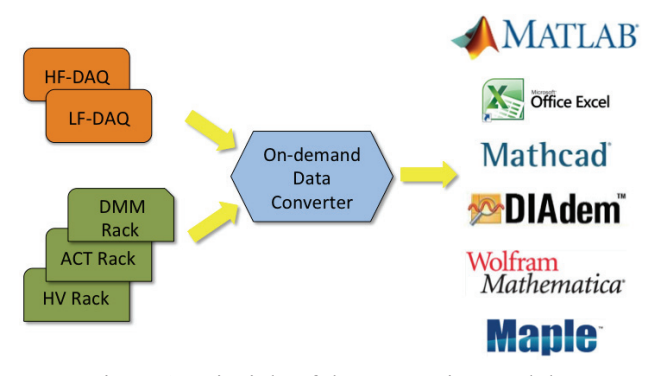
Figure 2: Principle of the conversion module.

A major effort was put in the definition of the TDMS structures and the hierarchy of the properties over the three levels (file, group, channel).