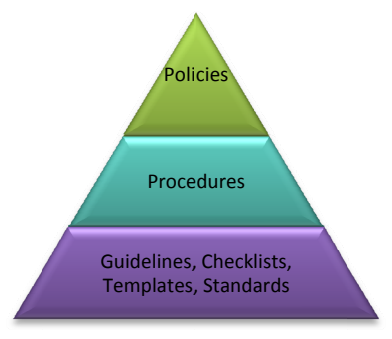
Figure 2: Argus Documentation.