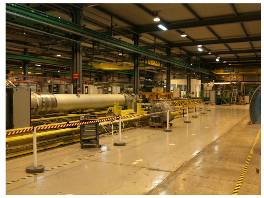
Figure 1: Part of the merged MTB facility.