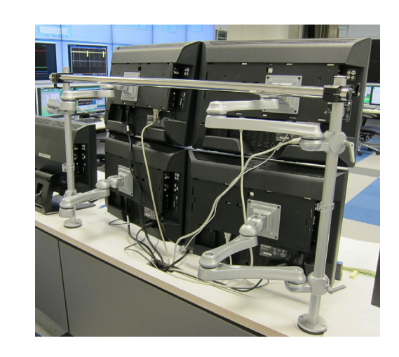
Figure 4: A desk has two poles to support 4 LCD panels.

workstation racks. The current back area is almost empty space aside from the three racks for networking and interlocks and sliding shelves for document archives. The operator sometimes resets the interlock signal on the rack, but this is relatively rare. Placing interlock equipment in the back area is convenient for the operator and satisfies the design guideline, which require the number of machines to be as low as possible.