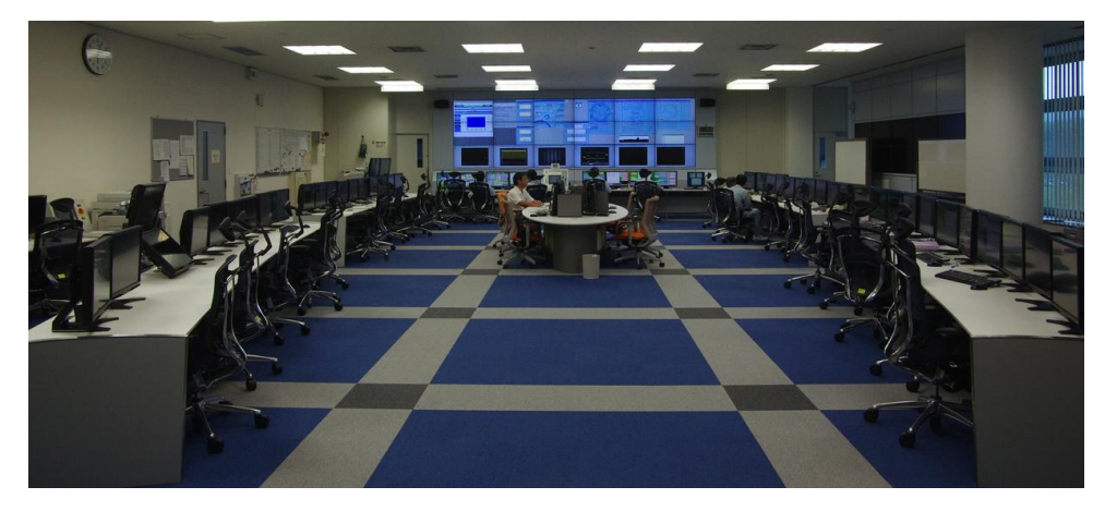
Figure 1: View of the new SPring-8 control room.

quirement in the future. Currently, SPring-8 accelerators and beam lines are controlled by less than 17 workstations in the control room. There are more than 7 spare spaces for workstations.