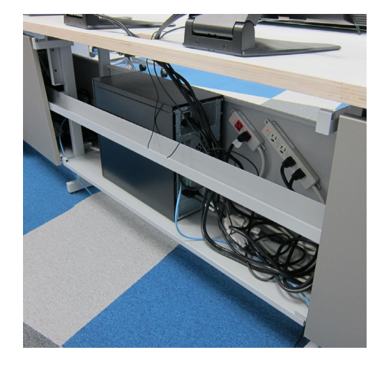
Figure 3: Back view of the control desk. A workstation is built in. Two lines of AC power are supplied. One is stabilized by UPS for the workstation and the other is not stabilized.

The oval table in the center had six PCs, which were used for office work such as for writing reports, reading docu-