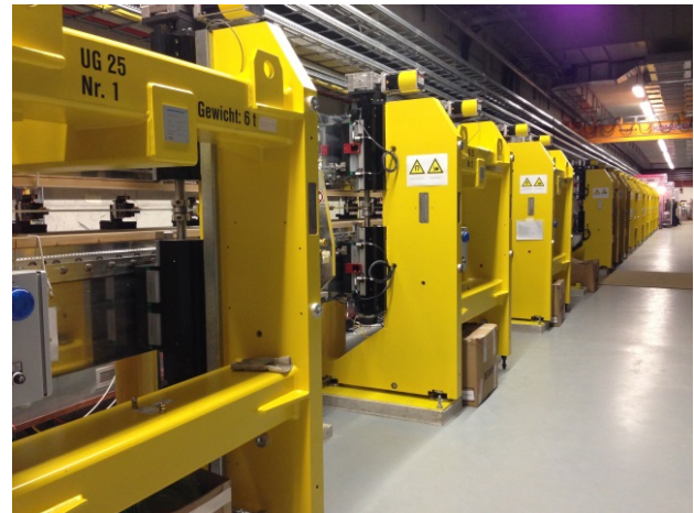
Figure 1: FLASH2 undulator beamline with twelve variable gap undulators.

Mounting the FLASH2 electron beamline, including 12 undulator modules (Fig. 1), was finished in January 2014. The official permission of FLASH2 beam operation was given in early February, and the beam commissioning started in March.