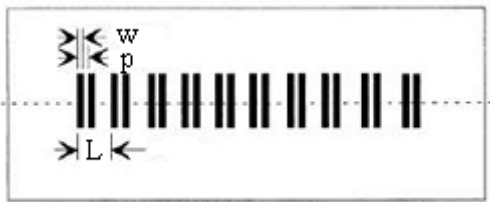
Figure 3: Multi-slit grating for interference.

The module of g(\delta\xi) is the fringe visibility. In our case, the diffraction component is the combination of multi-slit grating, as shown in Fig.3. The combination of multi-slit grating can be made on a foil, which contains a variety of double-slit pairs. There are three parameters in this foil: w is the width of a single slit; p is the intervals of the double slits; L is the intervals of the double-slit pairs. These parameters could be optimized to measure a series of spatial coherence lengths in one shot. A set of fringe visibility of different double-slits could be obtained. Thus the spatial coherence of the pulse could be characterized.