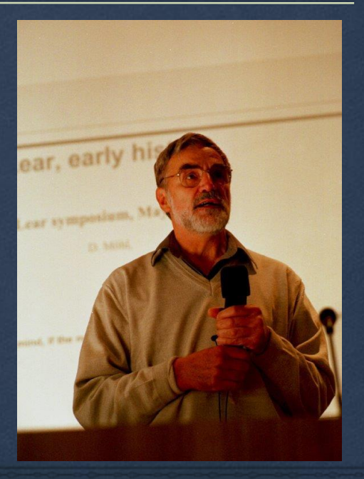
COOL'13 F. Caspers