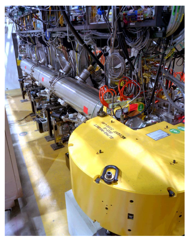
Figure 2. View of 425 MHz RFQs and alpha 2 magnet of the MEBT.

is the overall length of the machine was reduced and would easily fit into both the development area at Fermilab and the facility at BRF. The magnets for the MEBT and LEBT were designed and manufactured at Fermilab's Technical Support Division.<sup>6</sup> The final transport stage is the High Energy Beam Transport (HEBT) which utilizes a quadrupole, multipole and steering magnets from the original project to expand and control the beam to the required 2.5x10 centimeter size of the Havar target window.