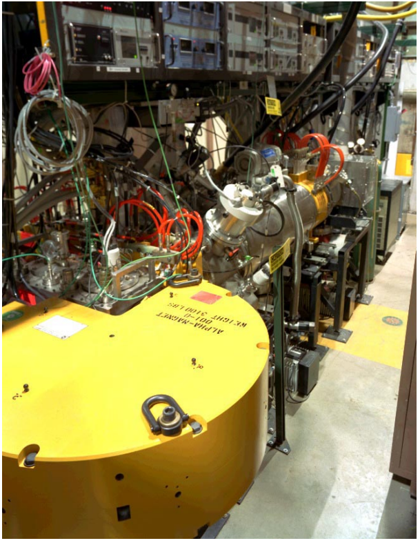
Figure 3. View of Ion Source, 212 MHz RFQ, Charge Stripper, and alpha 1 magnet of the MEBT.