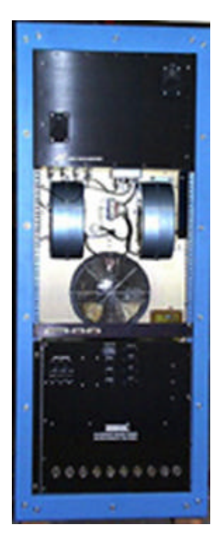
80 KW, 2 mHz, RF Amplifier designed and built for LBL (SNS)