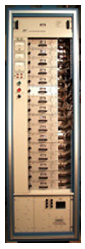
8 KW, 211 mHz RF Amplifier designed and built for BNL (NSLS)