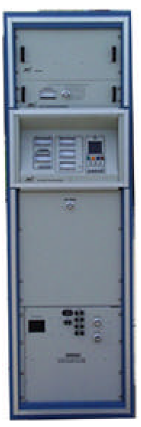
20 KW, 402 mHz, RF Amplifier designed and built for LBL (SNS)