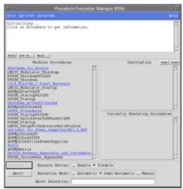
Figure 1: Procedure Execution Manager

The Procedure Execution Manager (PEM) is a graphical user interface tool that allows the user to execute Tcl/Tk machine procedures and monitor their progress (see Figure 1) [1]. At the Advanced Photon Source (APS), PEM procedures are used routinely during the operations of the different accelerators including the linac. A key advantage of the PEM is that it can be easily expanded by adding new machine procedures without changing the familiar user interface. The PEM allows the user to select an execution mode: Automatic, Semi-Automatic, or Manual. These levels signify the amount of interaction and monitoring that will occur. The machine procedures include 'steps' at which the PEM can pause. Manual mode pauses at all steps. Semi-Automatic only pauses at the first step. Automatic runs without pausing at any of the steps. As shown in the figure, a collection of routines can be grouped together and given a title. The machine procedures shown here are specifically designed for linac operations. Additional PEM screens exist for all of the accelerators at the APS. Since it was first written in 1996, the PEM has proven to be a very reliable and useful program.